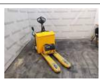
Offer 7 EJR 120n 115 540

FN913544 Serial #: 2015 Year of manufacture: 2014 Year of manufacture: 2014 Year of manufacture: 2.000 kg Battery: 24 V / 250 Ah Battery: 24 V / 250 Ah Charger: