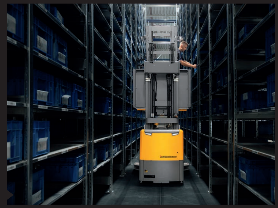
Simply depress the accelerator and the warehouseNAVIGATION system guides the operator to the destination via the shortest route.