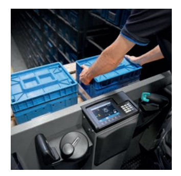
Greater comfort and individuality thanks to wide entry, height-adjustable control panels and a clearly arranged 4-inch display.