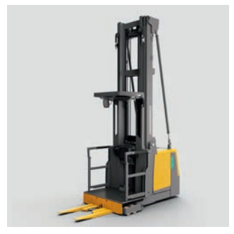
Perfect for the eCommerce sector with high product diversity.