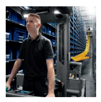
When speed is of the essence: With outstanding travel and lift acceleration, you can complete more picks every hour.