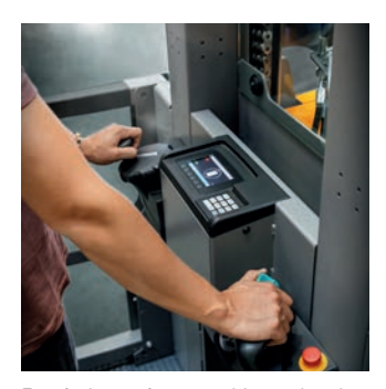
For fatigue-free working: clearly arranged display and height-adjustable control panel.