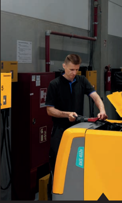
Maximum availability of all trucks – thanks to rapid intermediate charging and recharging.

Where high levels of pedestrian and vehicle traffic come together, avoiding collisions is paramount. This is where the optional personal and collision protection system (PPS) comes into play.