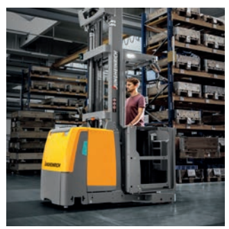
Perfect all-round visibility allows the operator to maintain a clear overview at all times.