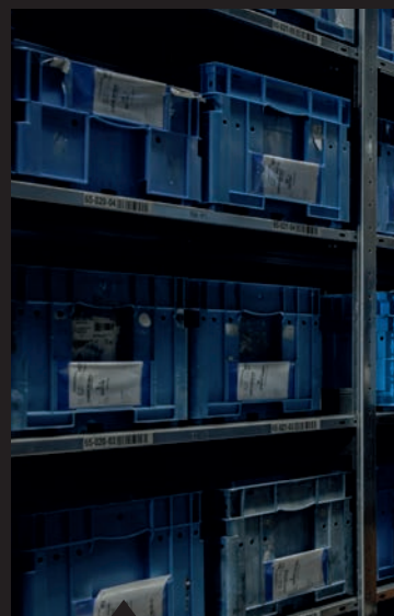
Maximum narrow-aisle performance in multi-shift operation with the EKS.