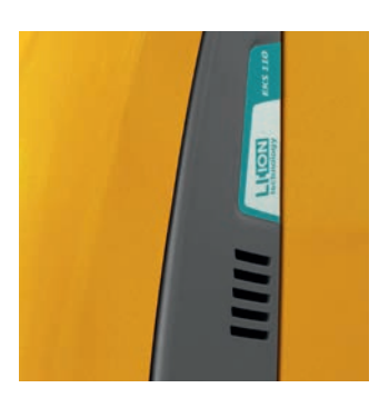
Lithium-ion batteries enable 24/7 truck availability.

Optimised residual capacity to ensure maximum utilisation of warehouse capacities.