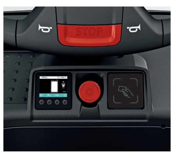
2-inch colour display and EasyAccess transponder