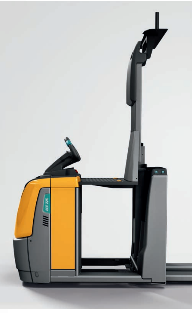
Lifting stand-on platform (HP)

For frequent picking at the second racking level, our hydraulic lifting stand-on platform offers the necessary lift for rapid and ergonomic work. The platform can be easily raised via a foot switch, freeing up the hands of your operator at all times.