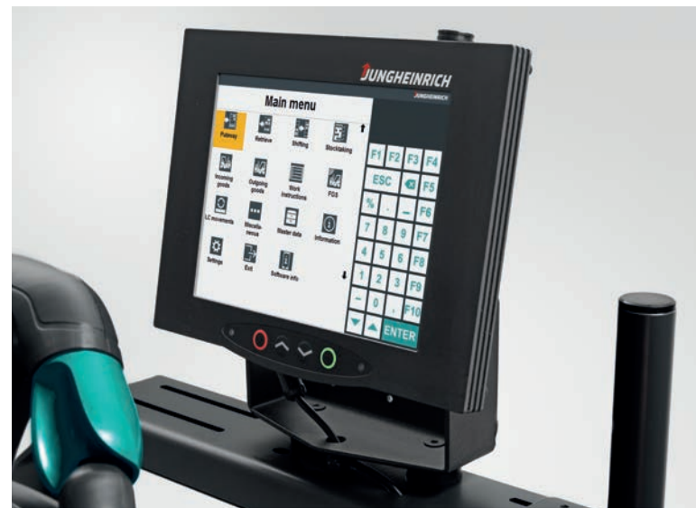
Intuitive radio data terminal