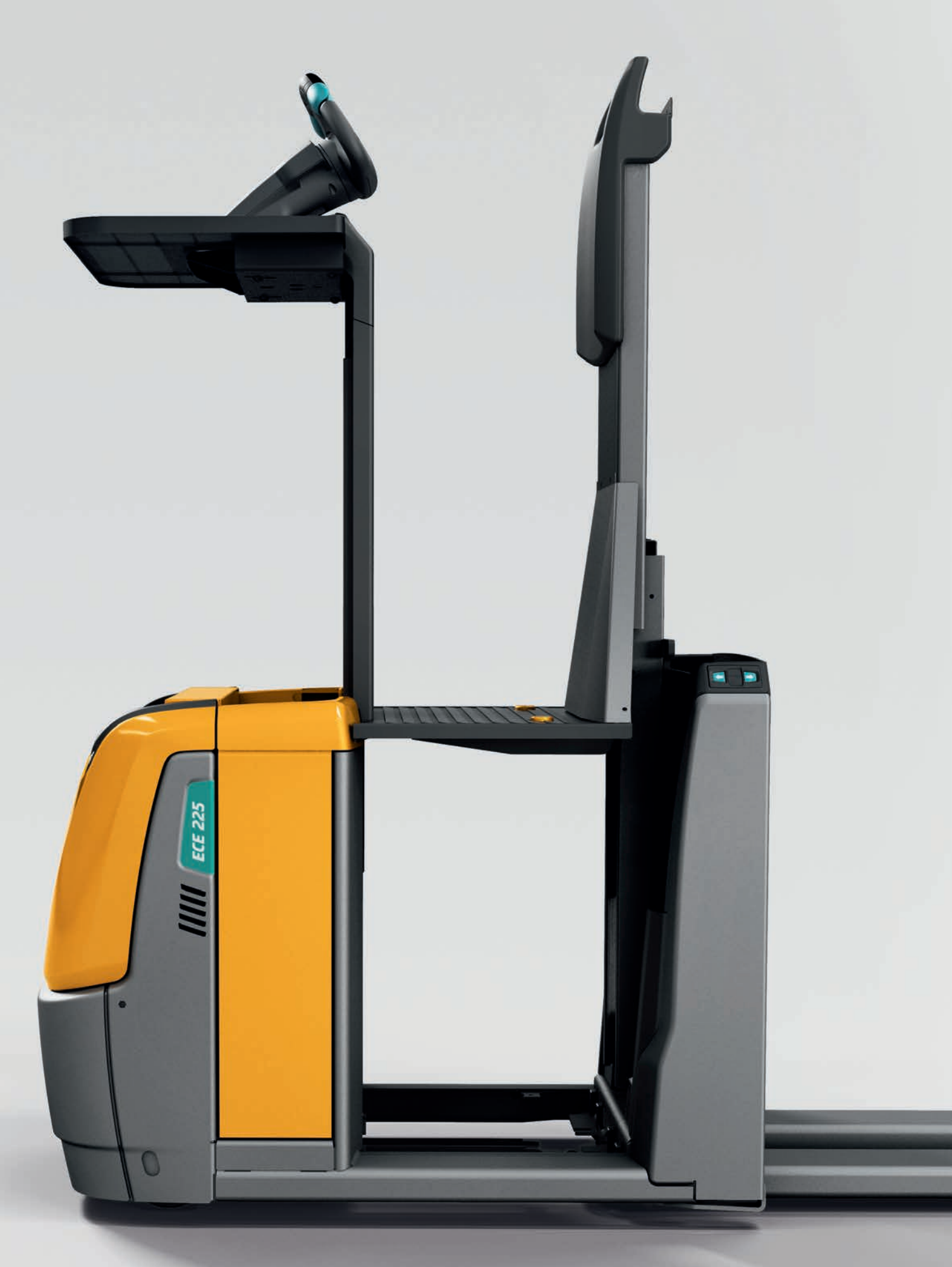
Lifting stand-on platform with control unit (HP-LJ)