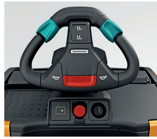
JetPilot: The height-adjustable multifunctional steering wheel