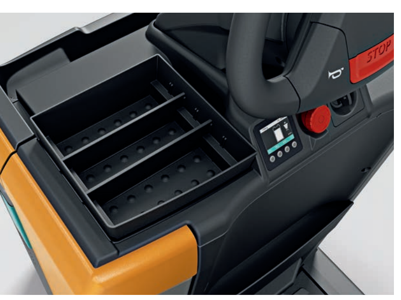
Storage box on the battery lid

Are you already familiar with all the options available for fully utilising the performance potential of your order picker and further maximising the pick rates? We make it easy for you. With a host of useful options and numerous additional features that ensure 100% adaptation of your order picker to your requirements.