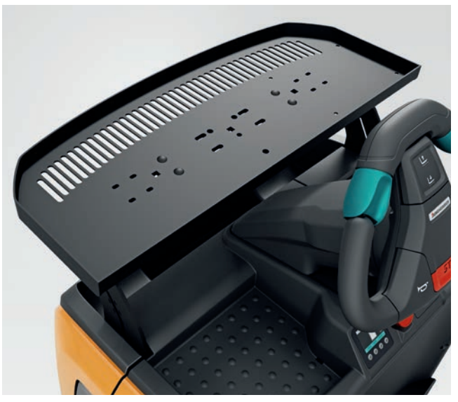
Order picking storage tray on the options bracket