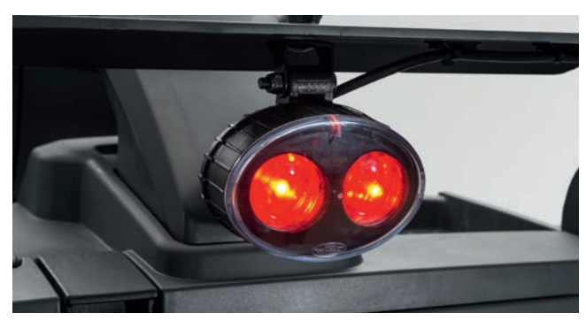
Floor-Spot for safe manoeuvring

Additional safety at blind spots or narrow areas of the warehouse is provided by the Floor-Spot, an easily visible red light. This is visible on the floor 3 m in front of the truck in the direction of travel.