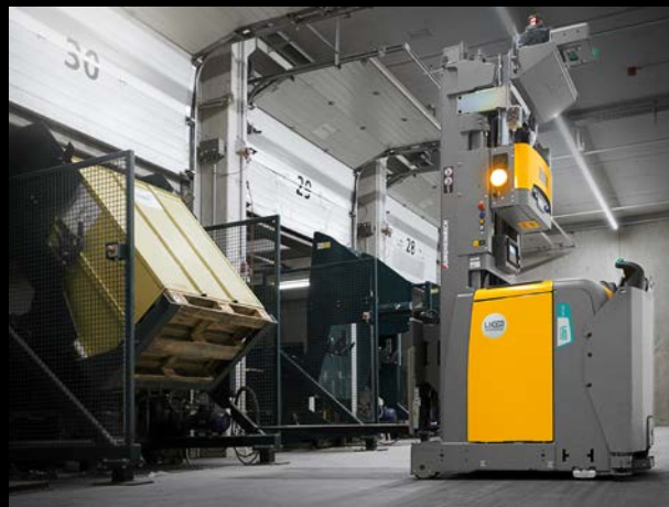
An automatic waste compactor was also connected for the first time.

The vehicles are a real helping hand in everyday logistics. That's why Arvato Supply Chain Solutions decided to name them after real superheroes.