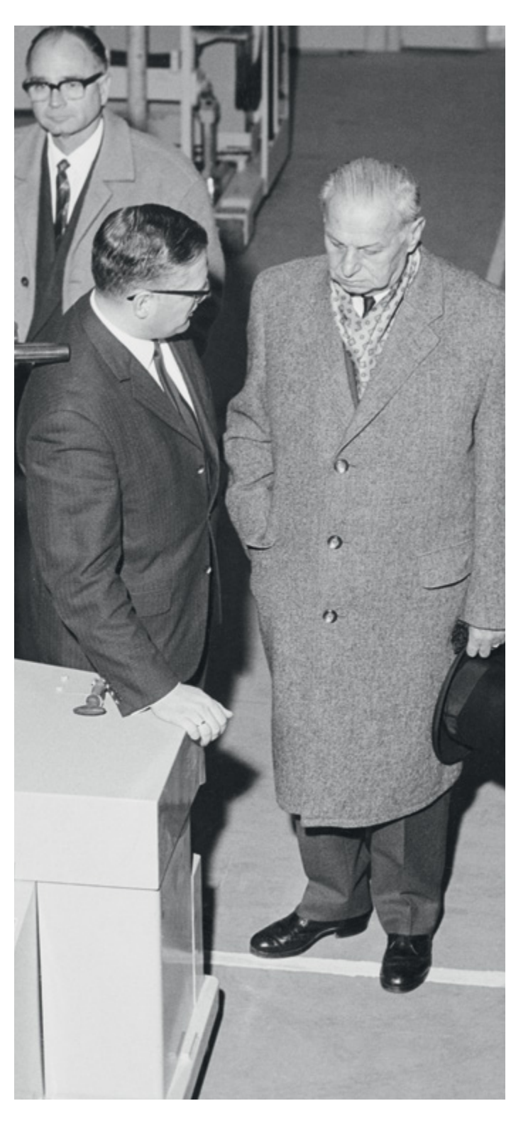
Successful product presentation: Hamburg's First Mayor Dr Herbert Weichmann (1965–1971) visits.

Growing consumption is changing the demand for constantly available items. Industrial and wholesale warehouses are increasingly developing from pure stockpiling into distribution centres where storing, compiling and distribution are interlinked.