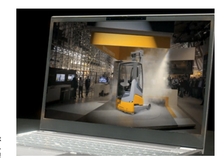
A piece of pioneering work is created in Norderstedt and unveiled at LogiMAT on 13 March 2018. A bombshell!

In Hamburg-Wandsbek, more than 500 employees move into the new corporate headquarters at the long-established Jungheinrich site at Friedrich-Ebert-Damm 129 in December 2015. The next construction project starts just a short time later: premises almost identical in their construction are erected next to the building to accommodate more employees at the site.