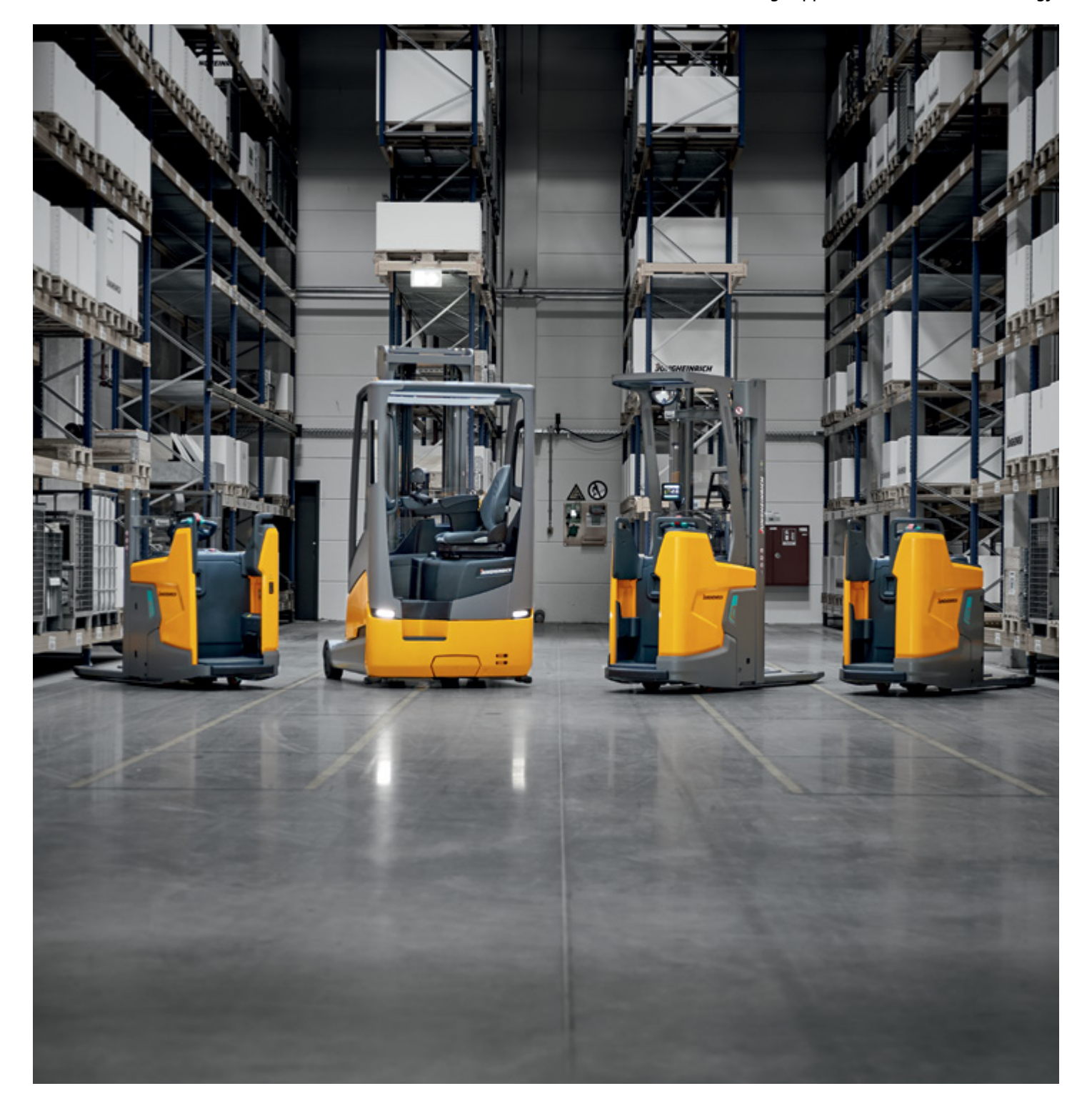
100 % electric. POWERLINE. We are a leading supplier in lithium-ion technology.

The smaller scale sets new standards in efficiency and body design, a basis for the development of further product innovations: the Jungheinrich POWERLINE. The ERD 220i, ERC 214/216zi and ERE 225i are more compact, safer, more comfortable and more efficient than their predecessors and competitors. Above all, however, they are particularly sustainable. From production to delivery to the customer, all POWERLINE vehicles are completely carbon-neutral.