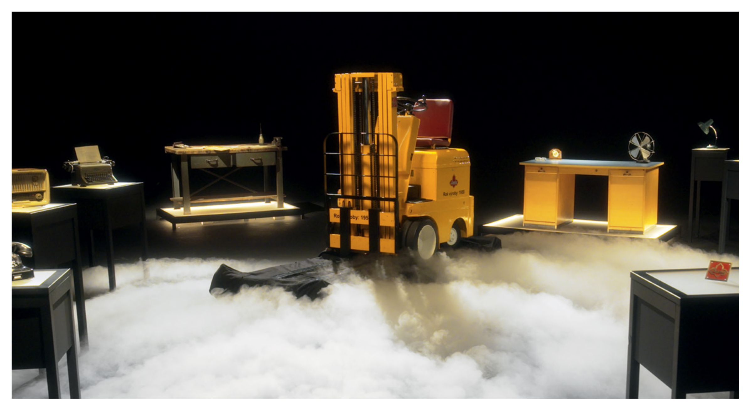
New truck type: The electric forklift with driver's seat "Ameise 55" is premiered at the 1953 Hanover Messe.