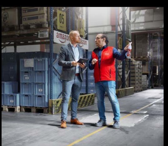
A common path to success: The long-standing collaboration between Simba and Jungheinrich is characterised by open and trusting communication.