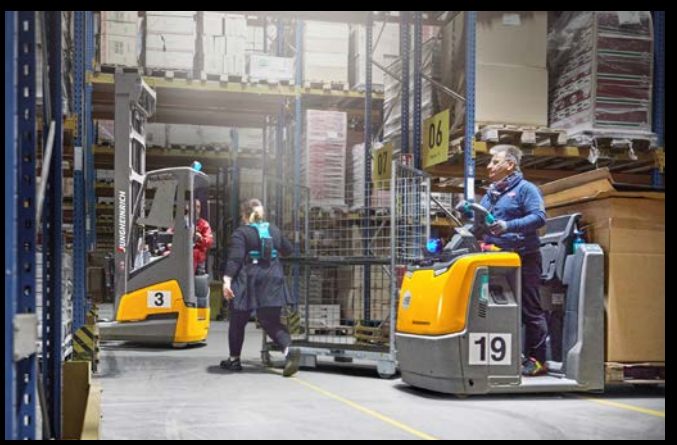
The high safety standards of the POWERLINE trucks ensure optimum employee protection – even at very busy times.