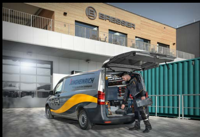
Fast troubleshooting: In case of emergency, a Jungheinrich service engineer is at the customer's site within the shortest possible time.