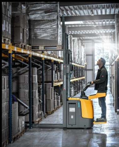
Safe stacking and retrieval of pallets with the ergonomic Jungheinrich ETV 214 reach truck.

Space-saving pallet racking allows maximum utilisation of warehouse capacity and effortless manoeuvring for the industrial trucks.