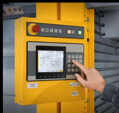
The digital control of the material flow provides an optimal overview of the goods movements and reduces the error rate.