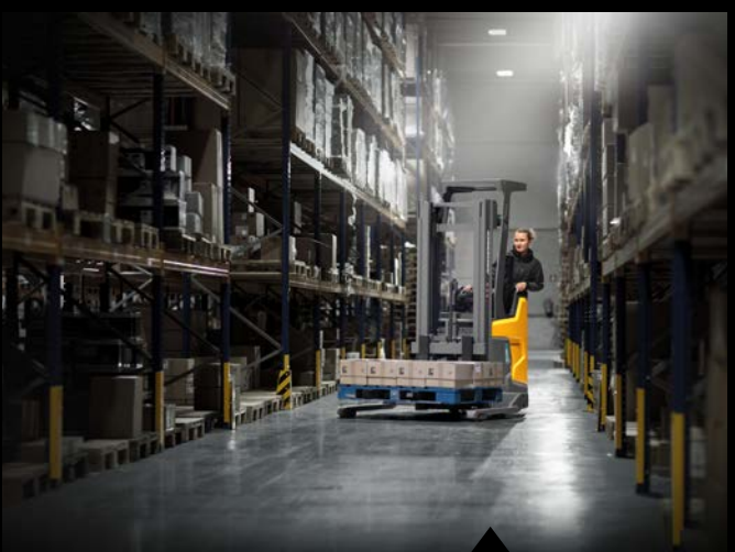
Suitable replacement trucks will be provided for you on request. During the repairs, you do not have to wait and can continue to achieve your goods throughput targets.