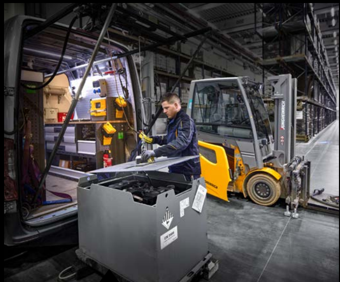
Naturally, we also only use original Jungheinrich spare parts for repairs. The rapid coordination of our technical teams and spare parts logistics significantly reduces downtime for your company.

Despite all the care and preventive measures you take with your fleet, there can come a time when a truck no longer functions properly. This is not always due to wear and tear, but can also be caused by events such as collisions. It's good to know that you can rely on our excellent team — we will repair the damage promptly, professionally and sustainably.