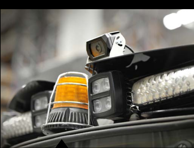
Parts Online includes accessories that increase productivity in the warehouse and also significantly improve safety, such as collision warning systems.

Whatever you have in mind: Numerous upgrade and modification options, including automation, make it easier for you to adapt to market changes and increasing requirements.