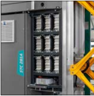
Maximum efficiency thanks to storing of braking energy in Super-Caps