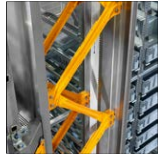
Energy-efficient lightweight construction using aluminium extrusion profiles