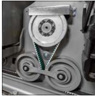
Omega drive integrated in the mast base for minimum approach dimensions