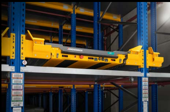
Integrated shuttle warehouse for the storage of hazardous goods.

Thanks to the new warehouse and the adaptation of internal logistics, AGLUKON now benefits from short distances and efficient processes.