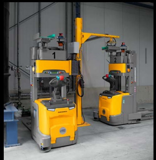
Automatic charging of the AGVs ensures maximum efficiency.