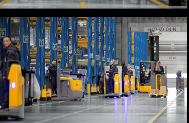
Normal A/S relies almost exclusively on Jungheinrich POWERLINE trucks in the new warehouse.