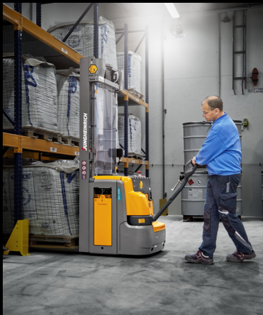
Handling heavy loads really demonstrates the power of the EFG 425k.

The EJC 2z stacker truck is perfect for intensive use and for storing and retrieving heavy loads.