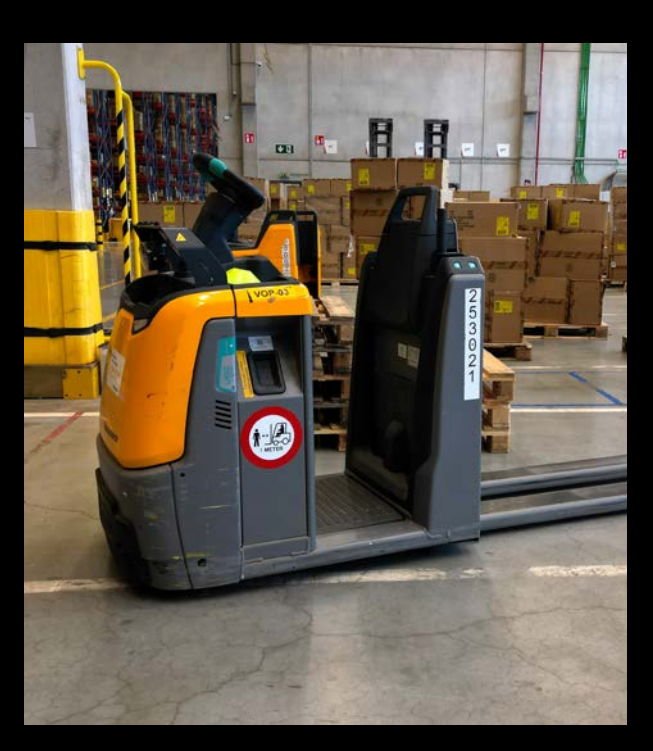
Compact, manoeuvrable and powerful: the Jungheinrich horizontal order picker with maximum picking performance and optimum energy efficiency.

Efficiency in 2-shift operation: lithiumion technology for 50,000 m² hall size.