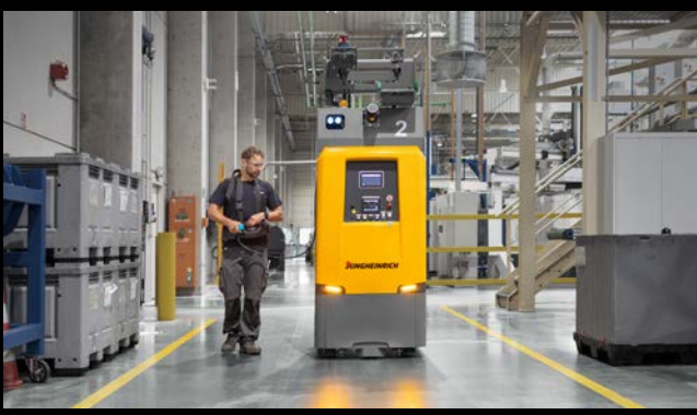
The intuitive interface and manual intervention options offer maximum flexibility in the operation of EKSa trucks.