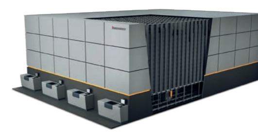
PowerCube Compact storage system for totes Max. system height: 12,000 mm Max. stack height: 33 totes Max. totes payload: 50 kg