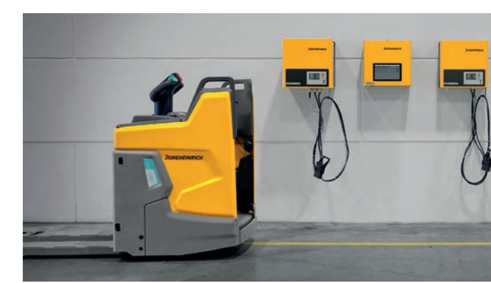
OPTIMISED CHARGING FOR ALL BATTERY TYPES Whether as a stationary or an on-board charger, we have the optimal solution for your battery. An active load management ensures the cost-optimized charging through peak shaving.