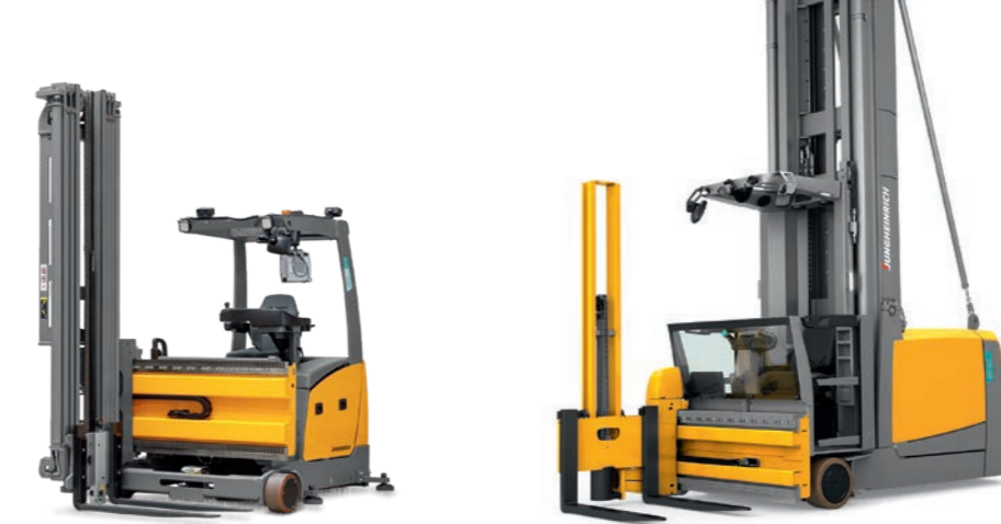
EFX 411/414*** Tri-lateral stacker Height class: up to 9,000 mm Max. capacity: 1,360 kg EKX 410-516k*** Order picker/tri-lateral stacker Max. lift height: 18,000 mm Max. capacity: 1,600 kg