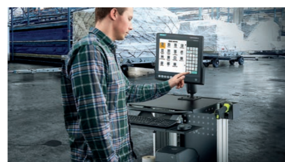
TERMINALS, SCANNERS AND ACCESSORIES ► Truck and handheld terminals for paperless order processing in the warehouse. ► Reliable recording and labeling with scanners and label printers. ► Tailored Wi-Fi analysis to optimise the mobile data connection. ► Mobile workstations for locally flexible provision of scanners, printers and terminals.