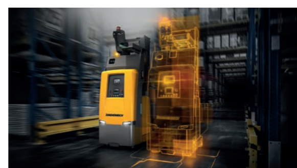
MOBILE ROBOT MANAGEMENT ► Combination of central order management and truck control. ► Continuous toolchain including reporting tool and visualisation in real time. INTERFACE MANAGEMENT: JUNGHEINRICH LOGISTICS INTERFACE ► Versatile interface for your warehouse. ► Simple communication between trucks, warehouse equipment and software. ► Intelligent networking of individual areas and processes.