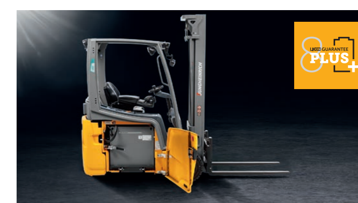
THE RIGHT BATTERY FOR EACH FORKLIIFT TRUCK Depending on the intensity of use, the shift operation design and the operational environment, we offer you the perfectly matched battery in lithium-ion or lead-acid technology.