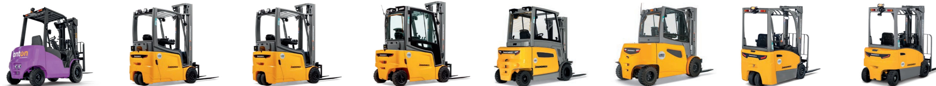
CBH 2.0/2.5/3.0 Electric 4-wheel forklift truck Max. lift height: 4,800 mm Max. capacity: 3,000 kg EPG 112 Electric 3-wheel forklift truck Max. lift height: 7,000 mm Max. capacity: 1,200 kg EPG 213-220 Electric 3-wheel forklift truck Max. lift height: 7,000 mm Max. capacity: 2,000 kg EPG 316-320 Electric 4-wheel forklift truck Max. lift height: 7,000 mm Max. capacity: 2,000 kg EPG 425-435 Electric 4-wheel forklift truck Max. lift height: 7,500 mm Max. capacity: 3,500 kg EPG 535k-550 Electric 4-wheel forklift truck Max. lift height: 7,500 mm Max. capacity: 5,000 kg EPG BA 113/115, BB 216k Electric 3-wheel forklift truck Max. lift height: 6,500 mm Max. capacity: 1,600 kg EPG BC 316-330 Electric 4-wheel forklift truck Max. lift height: 6,500 mm Max. capacity: 3,000 kg