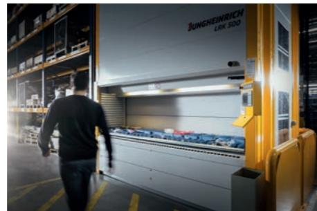
Vertical lift system