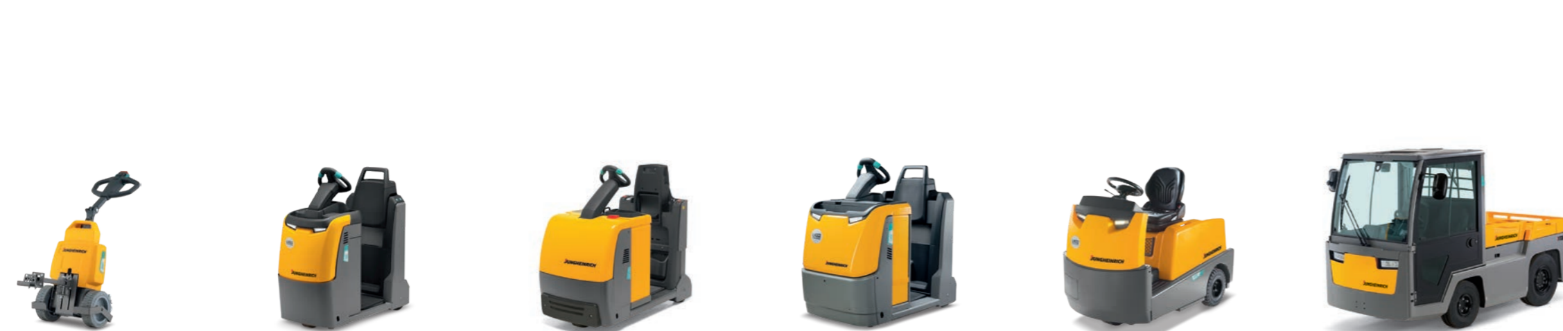
EZS 010 Electric pedestrian tow tractor Max. towing capacity: 1,000 kg EZS 130 Electric stand-on tow tractor Max. towing capacity: 3,000 kg EZS C40 Electric stand-on tow tractor Max. towing capacity: 4,000 kg EZS 350 Electric stand-on tow tractor Max. towing capacity: 5,000 kg EZS 570-5100 Electric sit-on tow tractor Max. towing capacity: 10,000 kg EZS 7280 Electric sit-on tow tractor Max. towing capacity: 28,000 kg