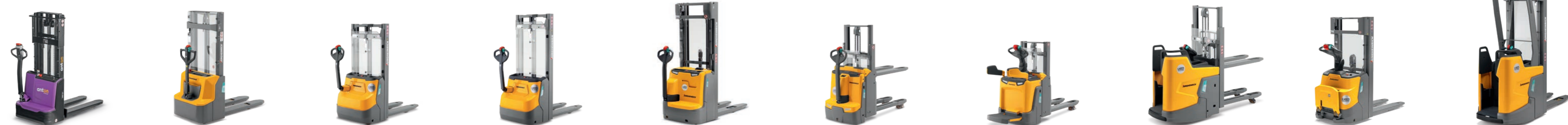
PSM 1.2 Electric pedestrian stacker Max. lift height: 3,530 mm Max. capacity: 1,200 kg AMC 12/12z Electric pedestrian stacker Max. lift height: 3,500 mm Max. capacity: 1,200 kg EJC 010i Electric pedestrian stacker Max. lift height: 3,500 mm Max. capacity: 1,000 kg EJC 110i/112i** Electric pedestrian stacker Max. lift height: 4,700 mm Max. capacity: 1,200 kg Optional with mono mast EJC 212-230** Electric pedestrian stacker Max. lift height: 6,000 mm Max. capacity: 3,000 kg EJD 118i/120i/120/222 Electric pedestrian stacker for double-deck loading Max. lift height: 2,905 mm Max. capacity: 2,200 kg ERD 120i/120/220 Electric pedestrian stacker with stand-on platform for double-deck loading Max. lift height: 2,905 mm Max. capacity: 2,000 kg ERD 220i Electric pedestrian stacker with fixed stand-on platform for double-deck loading Max. lift height: 3,760 mm Max. capacity: 2,000 kg ERC 110i/112i* Electric pedestrian stacker with stand-on platform Max. lift height: 4,700 mm Max. capacity: 1,200 kg ERC 214i/216i** Electric pedestrian stacker with fixed stand-on platform Max. lift height: 6,000 mm Max. capacity: 1,600 kg