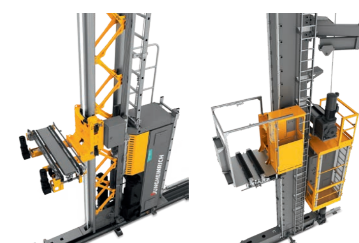
STC Miniload stacker crane Height class: up to 18,000 mm Max. capacity: 2 x 50 kg STP Pallet stacker crane Height class: up to 40,000 mm Max. capacity: 1,500 kg