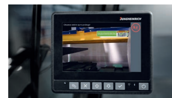
HIGHER PROCESS PERFORMANCE, INCREASED SAFETY ► zoneCONTROL for safe and efficient forklift traffic in every application. ► Digital camera systems: added/VIEW with additional features for the best visibility, collision prevention and error-free stacking and retrieval. ► Efficient and ergonomic: all systems can be used simultaneously on one display.

* Optional with additional lift ** Optional with additional lift or wide-tread version *** Optional with warehouseNAVIGATION antön Cost-efficient trucks, simple and reliable In addition, we also offer trucks made of stainless steel, with hot galvanisation, for cold store operations, in explosion-proof version, with the option to fully customise a truck – to your exact specification. Not every truck and service is available in every market.