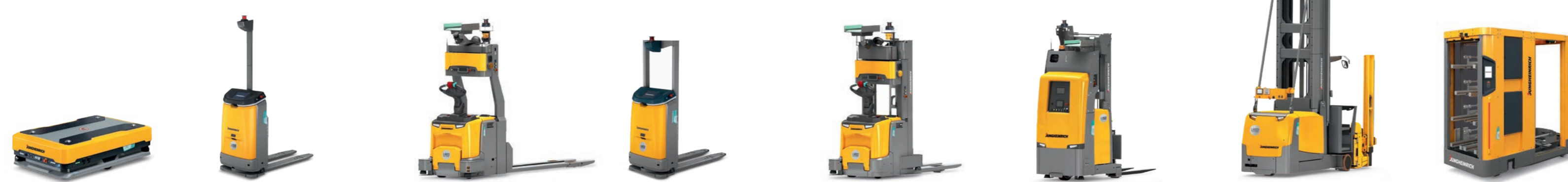
arculee M Mobile robot Underload transport Max. load height: 2,100 mm Max. capacity: 1,300 kg EAE 212a Mobile robot Low-level applications Max. lift height: 250 mm Max. capacity: 1,200 kg ERE 225a Mobile robot Low-level applications Max. lift height: 125 mm Max. capacity: 2,500 kg EAC 212a Mobile robot Low-stack applications Max. lift height: 1200 mm Max. capacity: 1,200 kg ERC 213a/217a Mobile robot High-stack applications Max. lift height: 4,400 mm Max. capacity: 1,700 kg EKS 215a Mobile robot High-stack applications Max. lift height: 6,000 mm Max. capacity: 1,500 kg EKK 514a/516ka/516a Mobile robot Automated VNA storage Max. lift height: 13,000 mm Max. capacity: 1,600 kg SOTO Mobile robot Tote handling Max. number of totes: 24 Max. tote weight: 20 kg