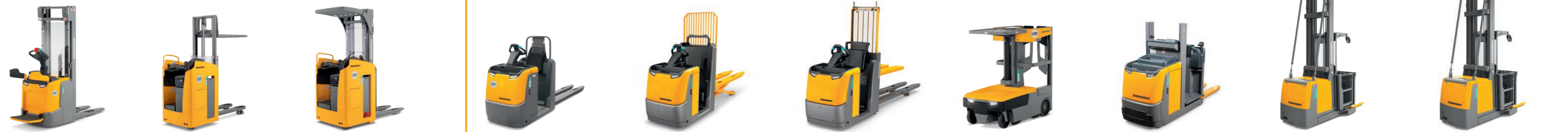
ERC 212-220** Electric pedestrian stacker with stand-on platform Max. lift height: 6,000 mm Max. capacity: 2,000 kg ESD 120/220 Electric stand-on/sideways-seated stacker for double-deck loading Max. lift height: 1,940 mm Max. capacity: 2,000 kg ESC 214-316* Electric sideways-seated stacker Max. lift height: 6,200 mm Max. capacity: 1,600 kg ECE 225 Low-level order picker Max. capacity: 2,500 kg Optional with easyPILOT remote operation ECE 310/320 Low-level order picker Max. capacity: 2,000 kg Optional with easyPILOT remote operation ECD 320 Low-level order picker Max. capacity: 2,000 kg Optional with easyPILOT remote operation EKM 202 Small parts order picker Max. picking height: 5,324 mm Max. capacity: 215 kg EKS 110 Medium-/high-level order picker Max. picking height: 4,600 mm Max. capacity: 1,000 kg EKS 210-412 Medium-/high-level order picker Max. picking height: 10,845 mm Max. capacity: 1,200 kg EKS 310s/412s*** Medium-/high-level order picker Max. picking height: 14,345 mm Max. capacity: 1,200 kg