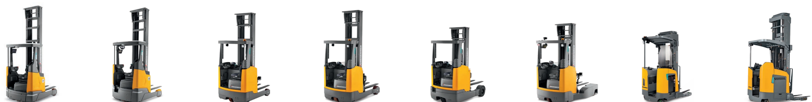
ETV 214i/216i Reach truck Max. lift height: 10,700 mm Max. capacity: 1,600 kg ETV 314i-325i Reach truck Max. lift height: 14,000 mm Max. capacity: 2,500 kg ETV 210-216i/ETM 214/216 Reach truck Max. lift height: 10,700 mm Max. capacity: 1,600 kg ETV 318-325i/ETM 325 Reach truck Max. lift height: 14,000 mm Max. capacity: 2,500 kg ETV C16/C20 Reach truck Max. lift height: 7,400 mm Max. capacity: 2,000 kg ETV Q20/Q25 Multi-way reach truck Max. lift height: 11,354 mm Max. capacity: 2,500 kg ETR 214-320/316d Pantograph reach truck Max. lift height: 11,354 mm Max. capacity: 2,000 kg ETR 420/416d Pantograph reach truck Max. lift height: 13,894 mm Max. capacity: 2,000 kg