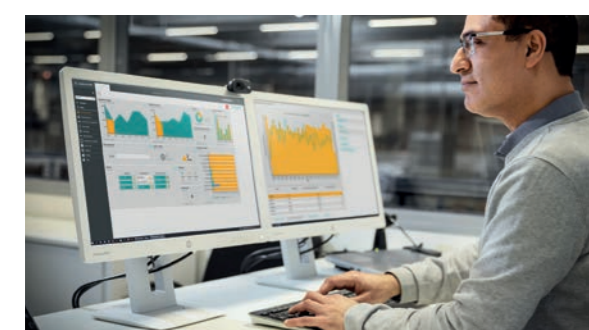
WAREHOUSE MANAGEMENT: JUNGHEINRICH WMS ► Intelligent management, control and optimisation of your warehouse. ► Optimum solution for warehouses of all sizes and complexities. ► Excellent warehouse technology integration. ► Unrivalled ease of use and future security. ► Wide functional scope including more than 180 highly optimised and individually configurable algorithms as well as artificial intelligence.