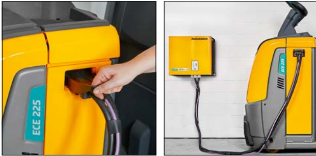
Comfort charger (for 240/360 Ah batteries)