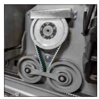
Omega drive integrated in the mast base for minimum approach