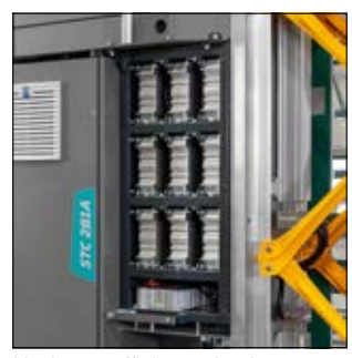
Maximum efficiency thanks to storing of braking energy in Super-