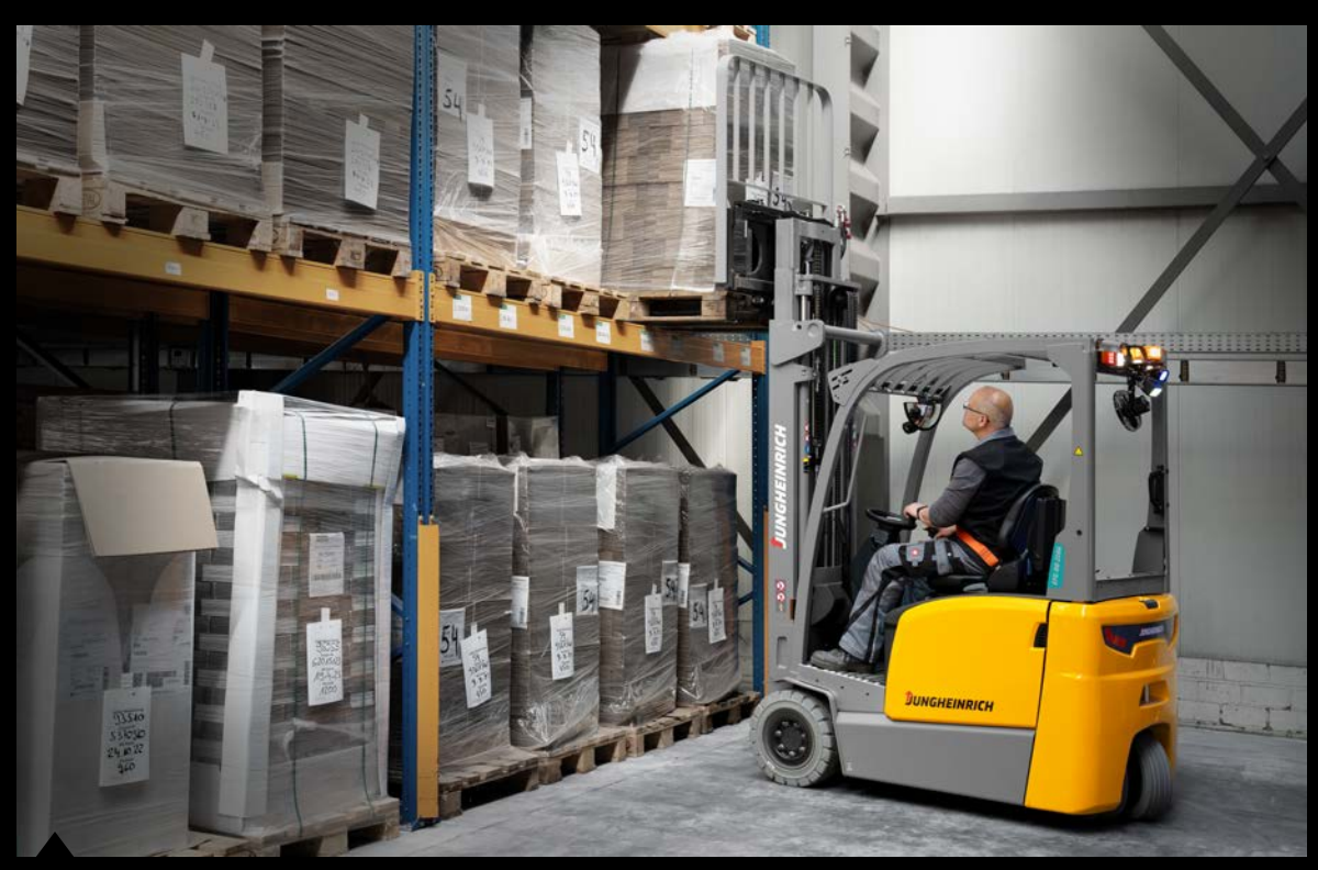
The proven Jungheinrich AC technology delivers high performance with low energy consumption.