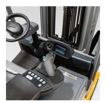
The ergonomic workplace supports efficient working and protects the operator.