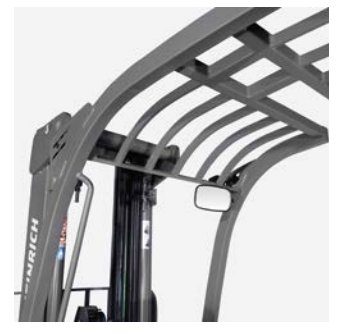
Arched overhead guard for optimal visibility typical of the BB and BC series.