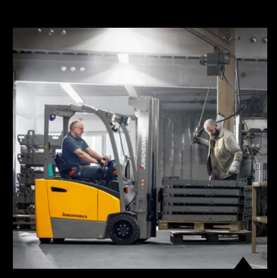
Impressive productivity with a capacity of up to 1.5 tonnes.