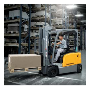
curveCONTROL assistance system for added safety when cornering.