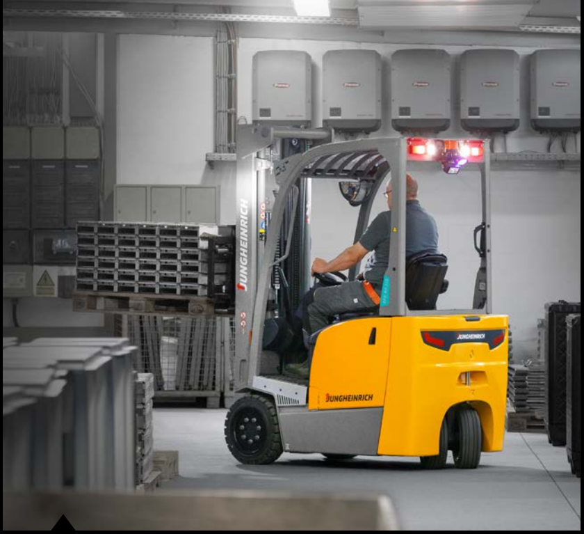
Available as standard, curveCONTROL automatically reduces cornering speed.