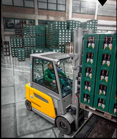
The EFG 430 is the ideal choice for HGV loading.

The combination of slimline B-pillar design and panoramic roof guarantees optimum visibility.