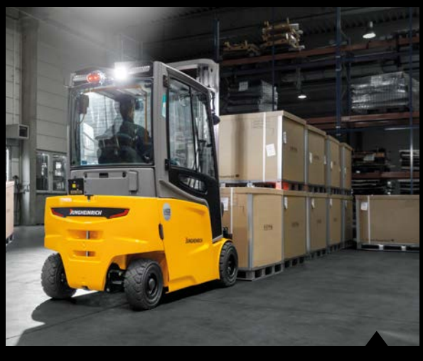
Maximum efficiency thanks to PureEnergy technology concept with the EFG 320.