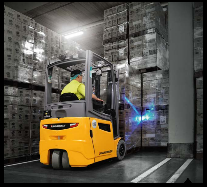
The Floor-Spot projects a blue light onto the floor in front of the truck, which alerts employees to the approaching industrial truck.