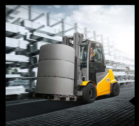
The EFG S50 with diverse attachment options for virtually any type of cargo.