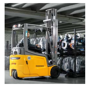
Extremely manoeuvrable , even in the tightest of spaces, thanks to 180° rotations on the spot.