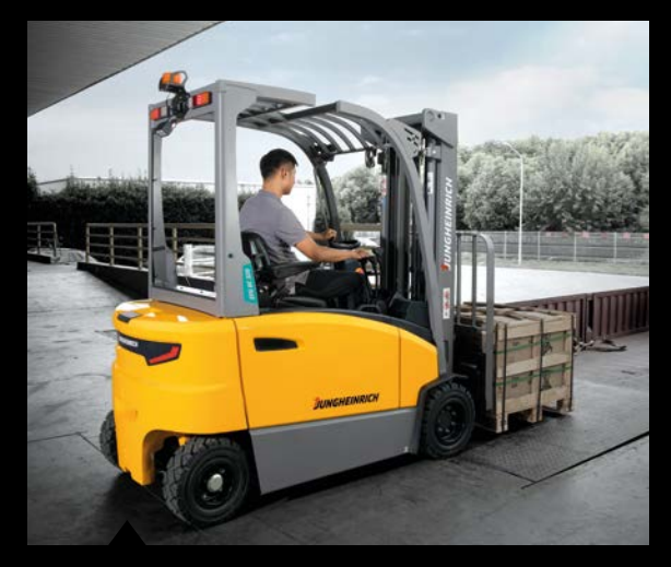
EFG BC 320: Intelligent Jungheinrich controller for maximum goods throughput.

EFG BC 320: Robust mast quality and high residual capacity of up to 5 m lift height.