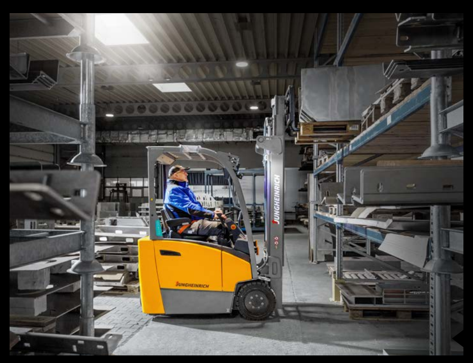
Optimal visibility of the fork and load with the EFG BA 115 .