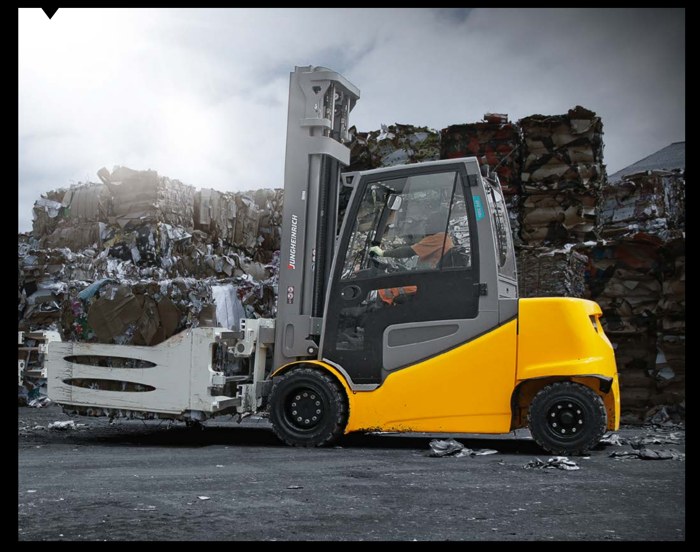
The EFG S40 is a veritable powerhouse for the most demanding applications.