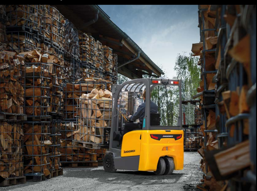
EFG BB 216k: Compact design for maximum flexibility in tight spaces.