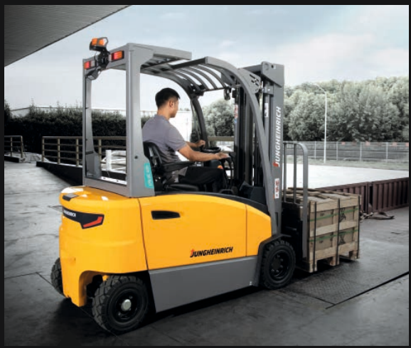
EFG BC 320: Intelligent Jungheinrich controller for maximum goods throughput.