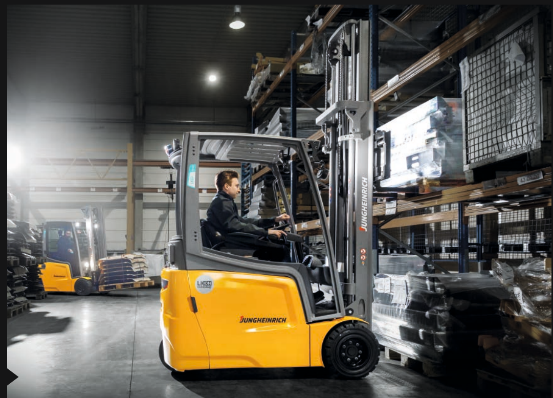
The EFG 216k – compact mast for perfect visibility.

The powerful hydraulic system enables the EFG 216k to achieve very high lift speeds.