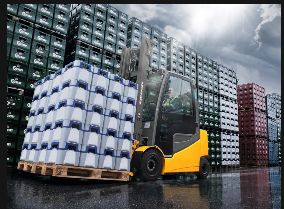
EFG 430 for industry-specific applications.