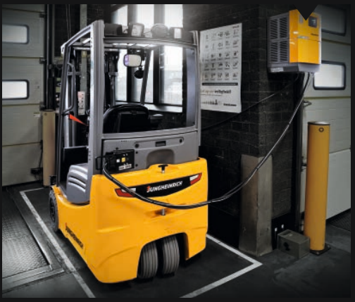
The Jungheinrich FMS controls utilisation of the fleet.

Short downtimes and fast charging thanks to li-ion technology.