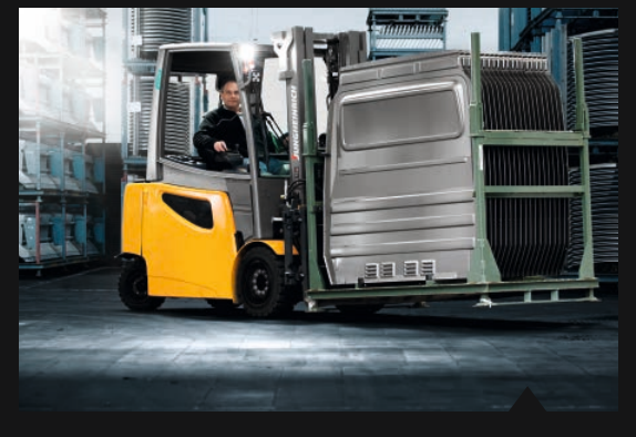
EFG 425 with minimal vibrations thanks to decoupling of cab and chassis.