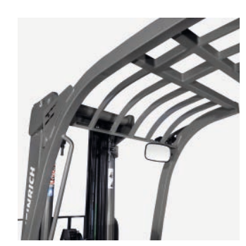
Arched overhead guard for optimal visibility typical of the BB and BC series.