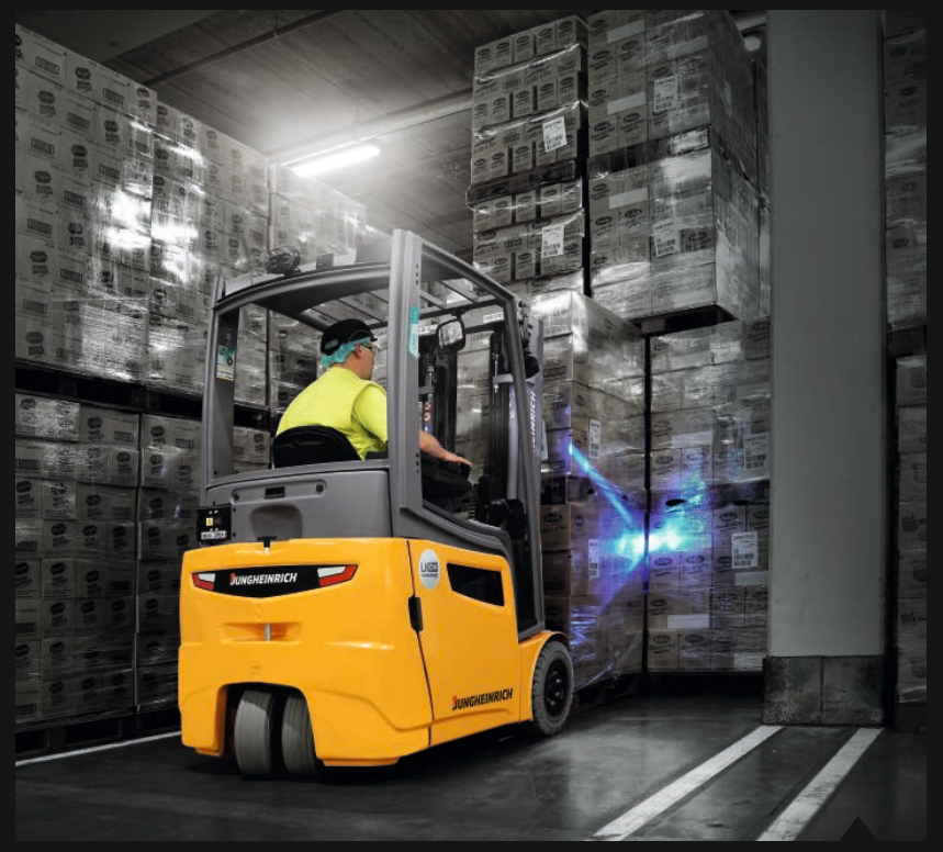
The Floor-Spot projects a blue light onto the floor in front of the truck, alerting employees to the approaching vehicle.