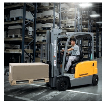
curveCONTROL assistance system for added safety when cornering.