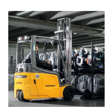
Extremely manoeuvrable , even in the tightest of spaces, thanks to 180° rotations on the spot