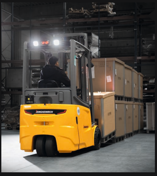
Energy recovery with regenerative braking on the EFG 112 .