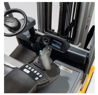
The ergonomic cockpit supports efficient working and protects the operator.