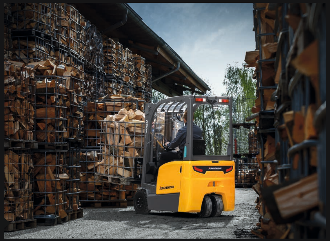
EFG BB 216k: Compact design for maximum flexibility in tight spaces.