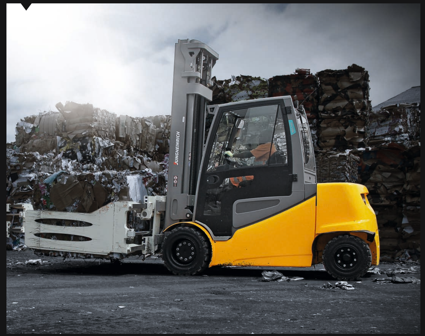
The EFG $40 is a veritable powerhouse for the most demanding applications.