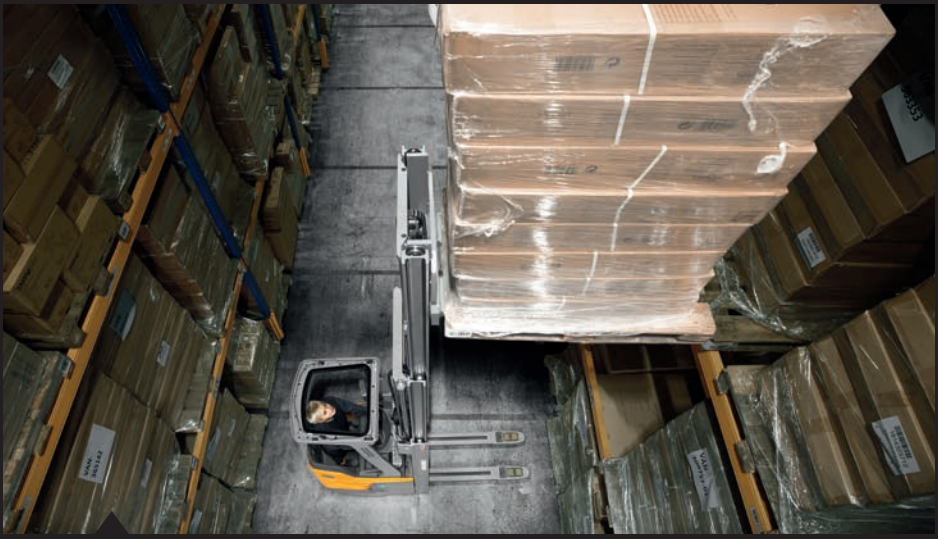
Optional assistance systems ensure safety when storing at high lift heights.