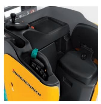
Thanks to its flexible multifunctional lever and folding seat, the ESD 1 guarantees ergonomic, comfortable and fatigue-free working while sitting and standing.