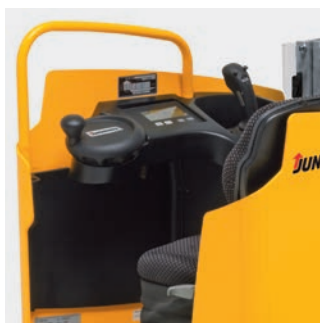
The smooth electric steering and the easily accessible controls of the ESD 2 offer full control over all driving functions, without needing to change your grip.