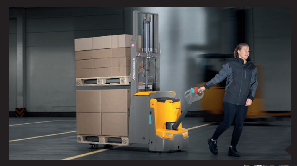
Twice as productive in the same time: the EJD 220 can accommodate two pallets in a double deck.