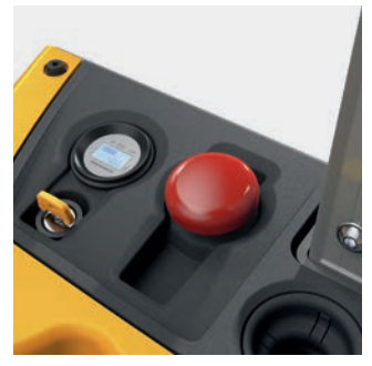
The EJC M: All important control instruments are arranged centrally: battery discharge indicator, hourmeter, emergency disconnect and key.