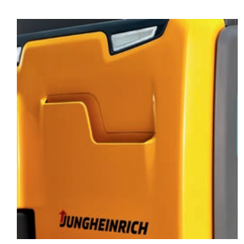
Everything under one roof – work documents are safely stowed in the EJC and always at hand.