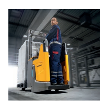
Spacious stand-on platform for maximum ergonomics and operator safety. Optional foot protection sensor.