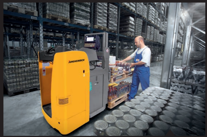
Throughput is increased quickly with double-deck transport.