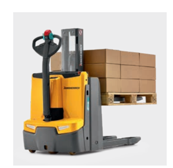
Ergonomic lift platform: order picking of goods of all kinds at a comfortable height.