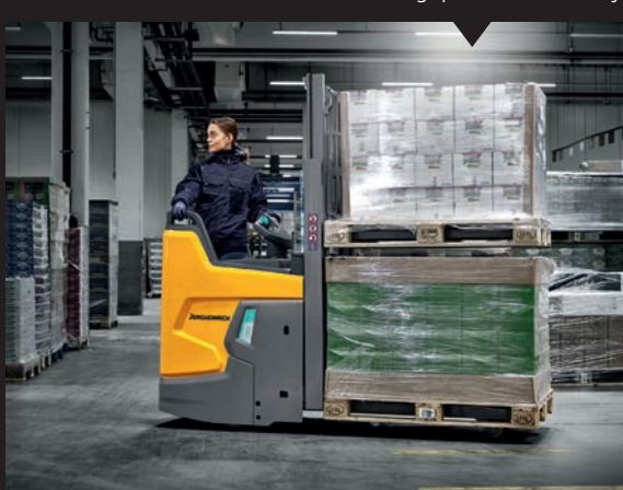
ERD 220i: optional HGV detection automatically reduces speed, thereby improving safety when accessing the loading ramp and when manoeuvring.

Compact powerhouse with additional lift – for increased throughput and efficiency.