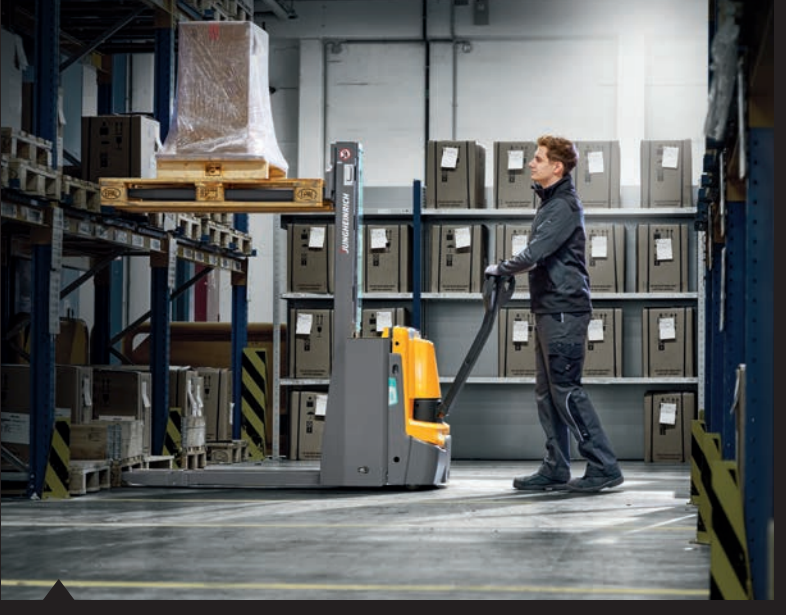
Compact, agile and powerful, even in narrow aisles: the EJD 118i with an innovative lithium-ion battery.