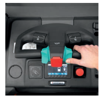
The smartPILOT electric tiller steering enables precise and easy steering with one hand.