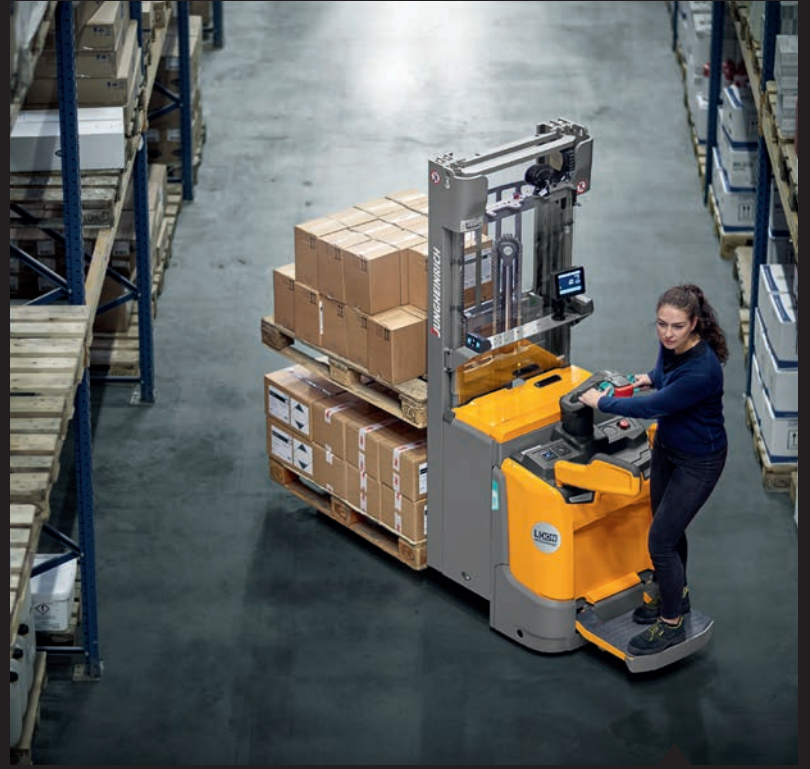
The ERC 216z is suitable for transporting goods over longer distances and for storing and retrieving them on higher rack levels up to 6 m.