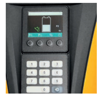
EMC 110: 2-inch truck display including discharge indicator and hourmeter (optional).