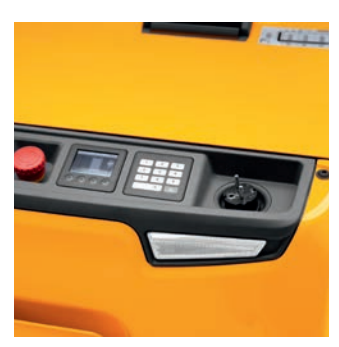
With on-board charger for quick and easy intermediate charging at any 230 V socket.