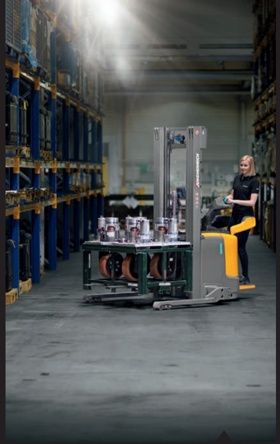
In the wide-track variant, the forks can be lowered to the ground, which makes it easier to pick up transverse pallets or special loads.