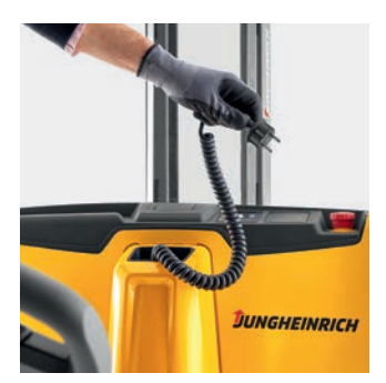
Quickly ready for use again: the on-board charger enables recharging at any 230 V socket.