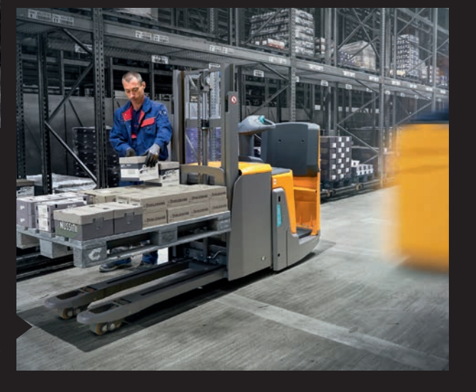
Well prepared for every application scenario. The ERD is available with four platform versions: folding, spacious, compact or as a picking platform.

The side-entry platform allows for quick entry and exit and is therefore well suited for order picking.