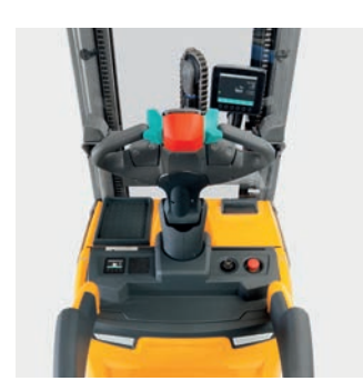
Many storage options and a reader-friendly 6-inch display for operationCONTROL or curveCONTROL make everyday work easier.