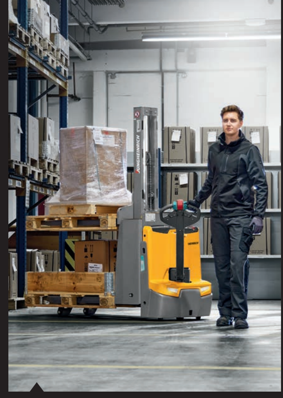
The EJD 118i offers maximum flexibility and increased ground clearance thanks to the integrated support arm lift.