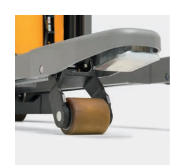
Thanks to the support arm lift, obstacles such as ramps, thresholds and uneven floors can be handled more easily.