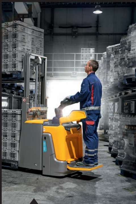
The ERD 220 with folding platform. The space-saving, flexible solution for a narrow warehouse environment.