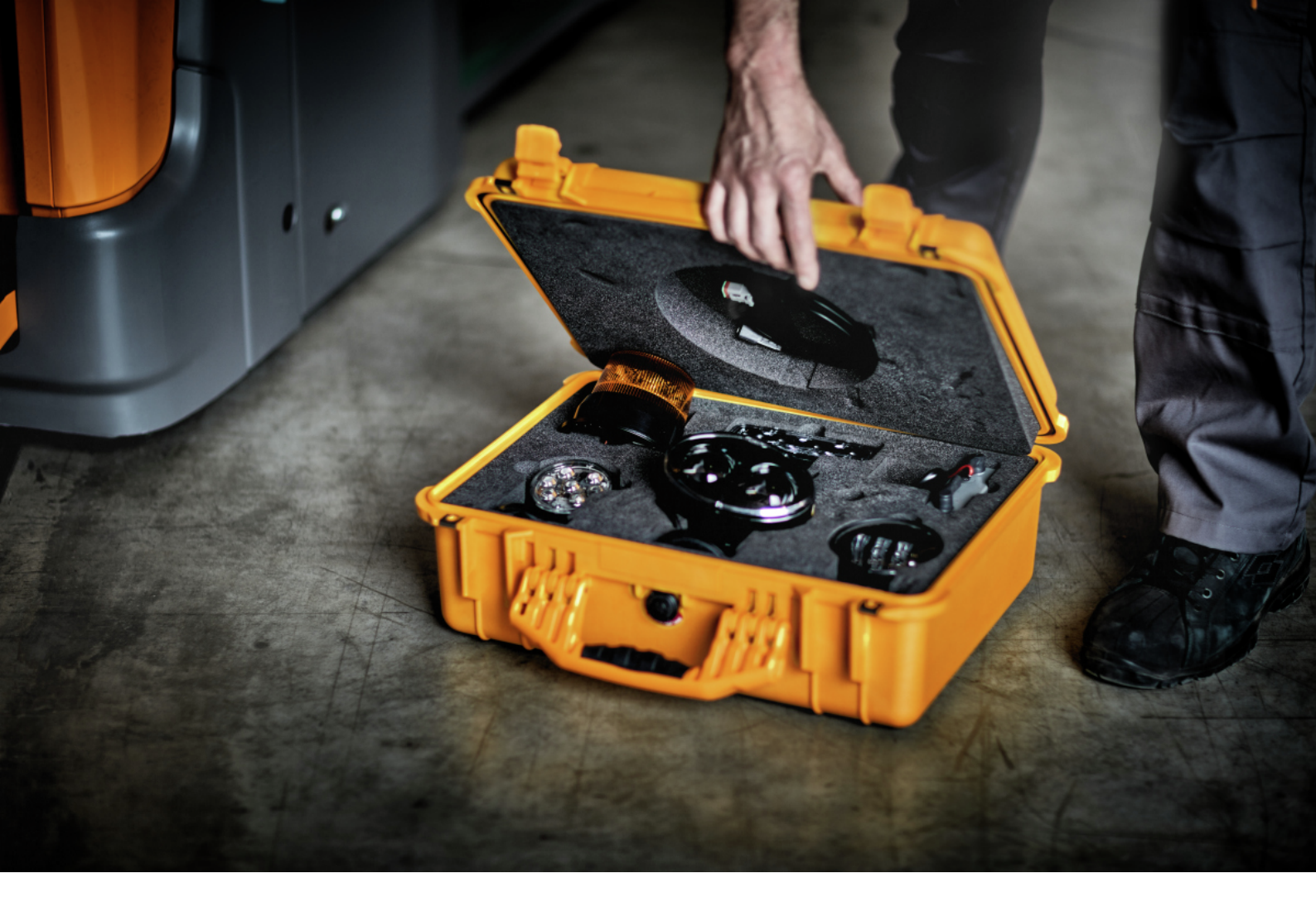
Services Jungheinrich Original accessories