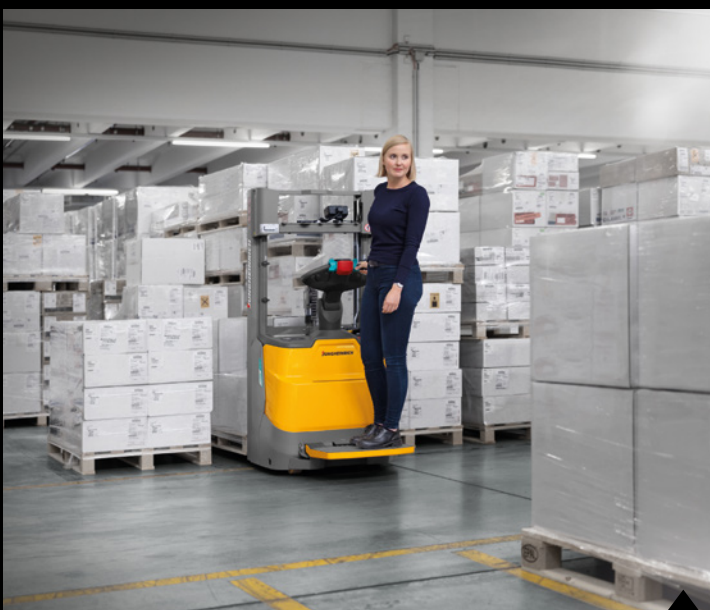
Transporting goods over medium to long distances? No problem, thanks to the hinged ride-on platform.