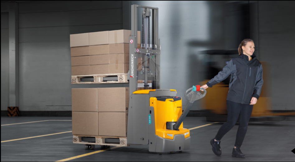
Twice as productive in the same amount of time: the EJD 220 can carry two pallets in a double stack.