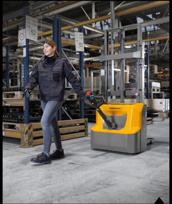
AMC 12: easy handling with the multifunction tiller handle, multifunction display and curveCONTROL.