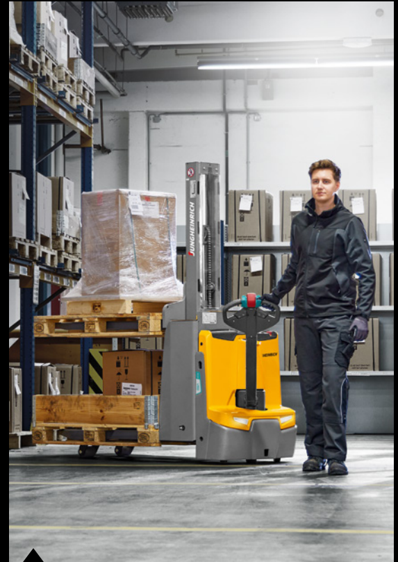
The EJD 118i offers maximum flexibility and greater ground clearance thanks to the integrated support arm lift.