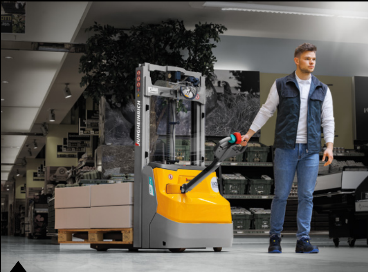
Efficient and space-saving for lighter transport tasks: the EJC 010i.