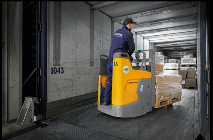
By detecting the lorry's surroundings, the vehicle automatically reduces speed, making intensive ramp driving much easier on the operator's back.