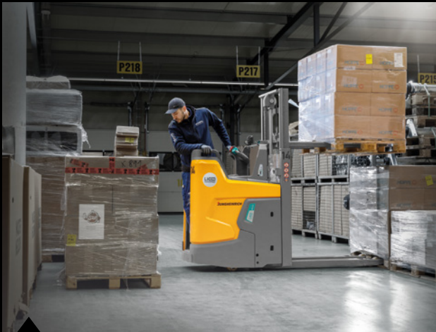
Optimised standing platform with three-sided protection enhances safety.