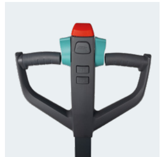
AMC 12: a multifunction tiller grip, easy to use with either hand.