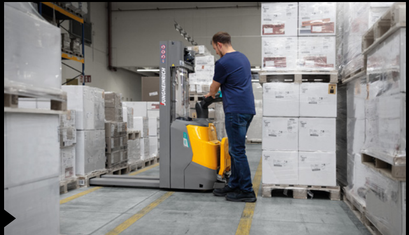
Easily navigates tight storage spaces with its small turning radius and compact design.