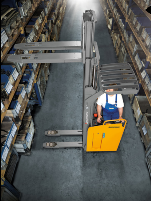
ESC 216z: The support arms can be raised independently of the forks (support arm lift), making it ideal for transport on uneven ground.