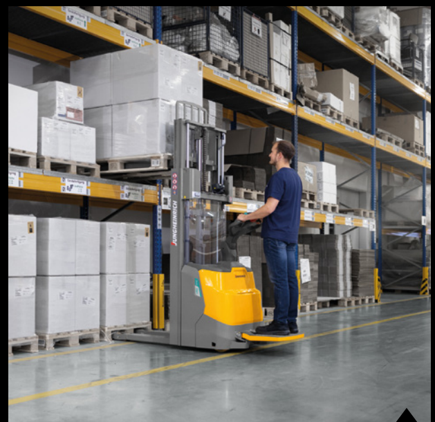
With a lift height of up to 4,700 mm, the ERC 1i makes storing and retrieving items from higher racking levels simple.