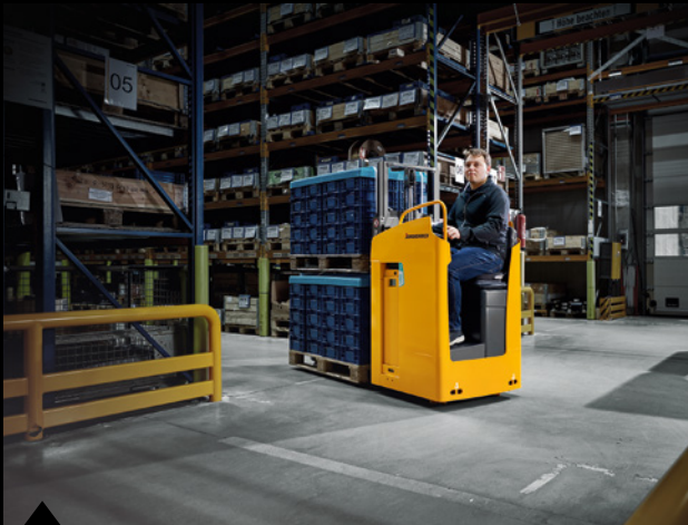
The ergonomic sideways seat gives the operator excellent visibility, even during frequent direction changes.