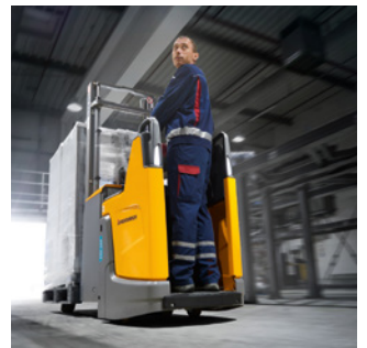
Spacious stand-on platform for maximum ergonomics and operator safety, with an optional foot protection sensor.