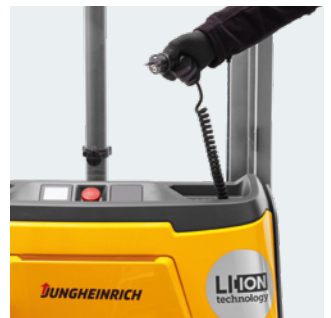
EJC 010i: flexible, decentralised charging at any standard socket thanks to the built-in charger.