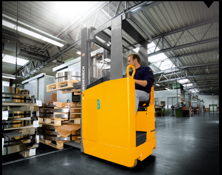
The robust chassis withstands even the toughest conditions.