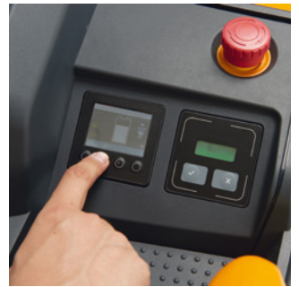
All key parameters always in clear view, such as battery charge level and operating hours.