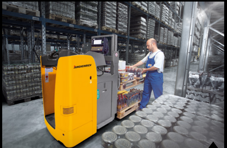
Double-stack transport quickly boosts handling efficiency.