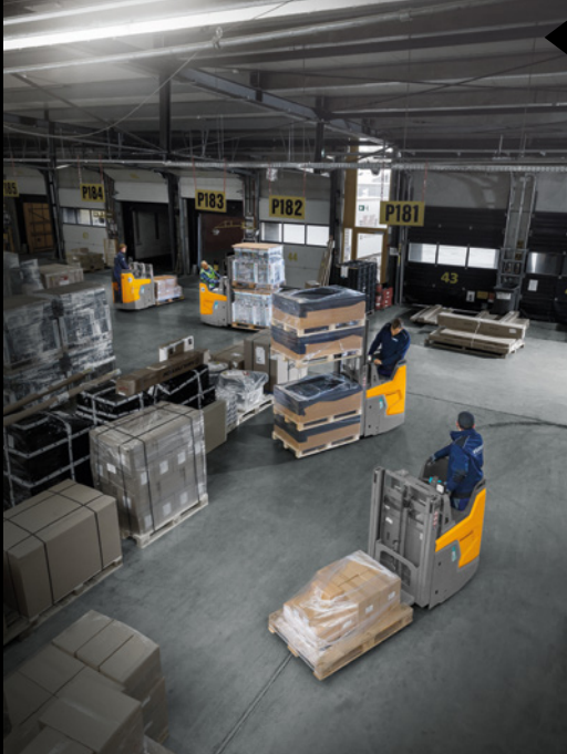
The ERD 220i high-lift stackers in use at NOERPEL — a perfect combination of sustainability and efficiency.

In operation 24/7 — powerful lithium-ion batteries ensure maximum availability.