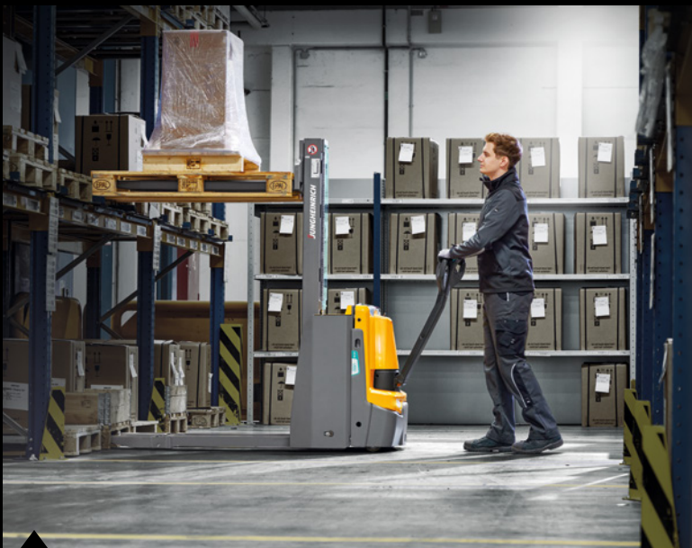
Compact, agile and powerful, even in narrow aisles: the EJD 118i with innovative lithium-ion battery.