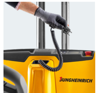
Ready to use again in no time: the integrated charger allows recharging at any 230V socket.