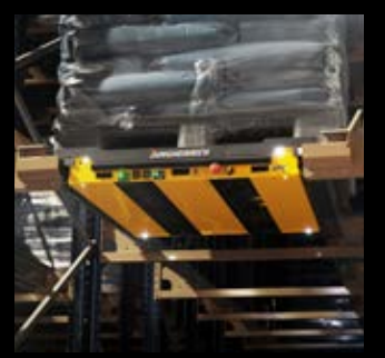
In compact storage systems, goods are transported by agile shuttles.