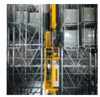
Stacker crane for pallets: speed and precision during storage and retrieval process.