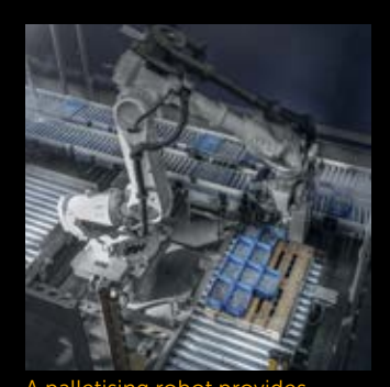
A palletising robot provides welcome relief when you are at peak capacity.

In the world of online retail, there is one simple rule: the shorter the delivery times, the happier the customer. Yet this places an additional strain on personnel. Unless, of course, you employ Automated Guided Vehicles for longer transport distances – up to 500 metres in this case. We implemented precisely this efficiency-boosting solution for one of the world's leading online retailers. The result: employees can now focus on more productive activities, and the investment paid for itself within a single year.