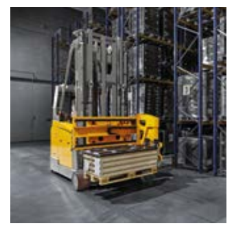
The ETX 515a is well equipped for manual, semi-automatic or fully automatic deployment. Incremental automation is also possible.