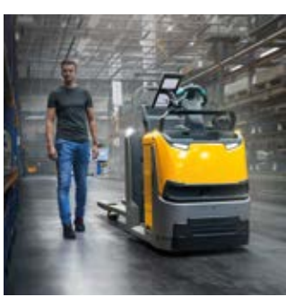
The easyPILOT mobile control system approaches the next picking location safely and intuitively, thus greatly assisting the operator.