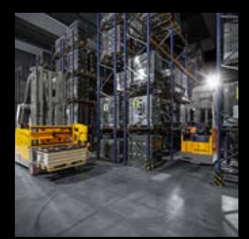
Reliable navigation in tight spaces: automated high-rack stackers.