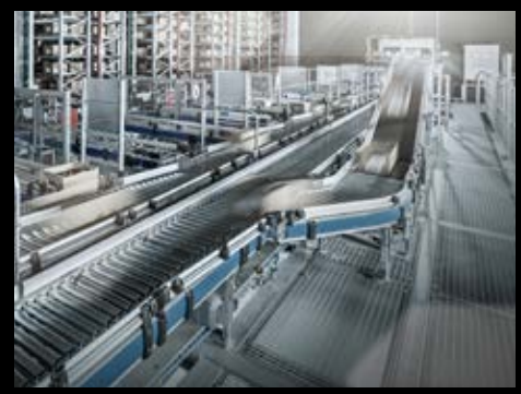
Ready for dispatch at lightning speed: highly efficient material flow with conveyor technology.

Whenever a spare or wear part is required for a Jungheinrich premium product, our customers worldwide can trust in a rapid resolution – within a single day, on 365 days a year and across three continents. For this very reason, we focussed on a high degree of automation from the outset when designing and implementing our own spare parts warehouse in Kaltenkirchen. Across 22,000 square metres of storage space, pallets are accommodated at heights of up to 31 metres, while we can also call upon 80,000 container storage locations. In combination with customised conveyor technology and a sophisticated IT infrastructure, up to 1,000 spare parts per hour can be prepared for dispatch at lightning speed.